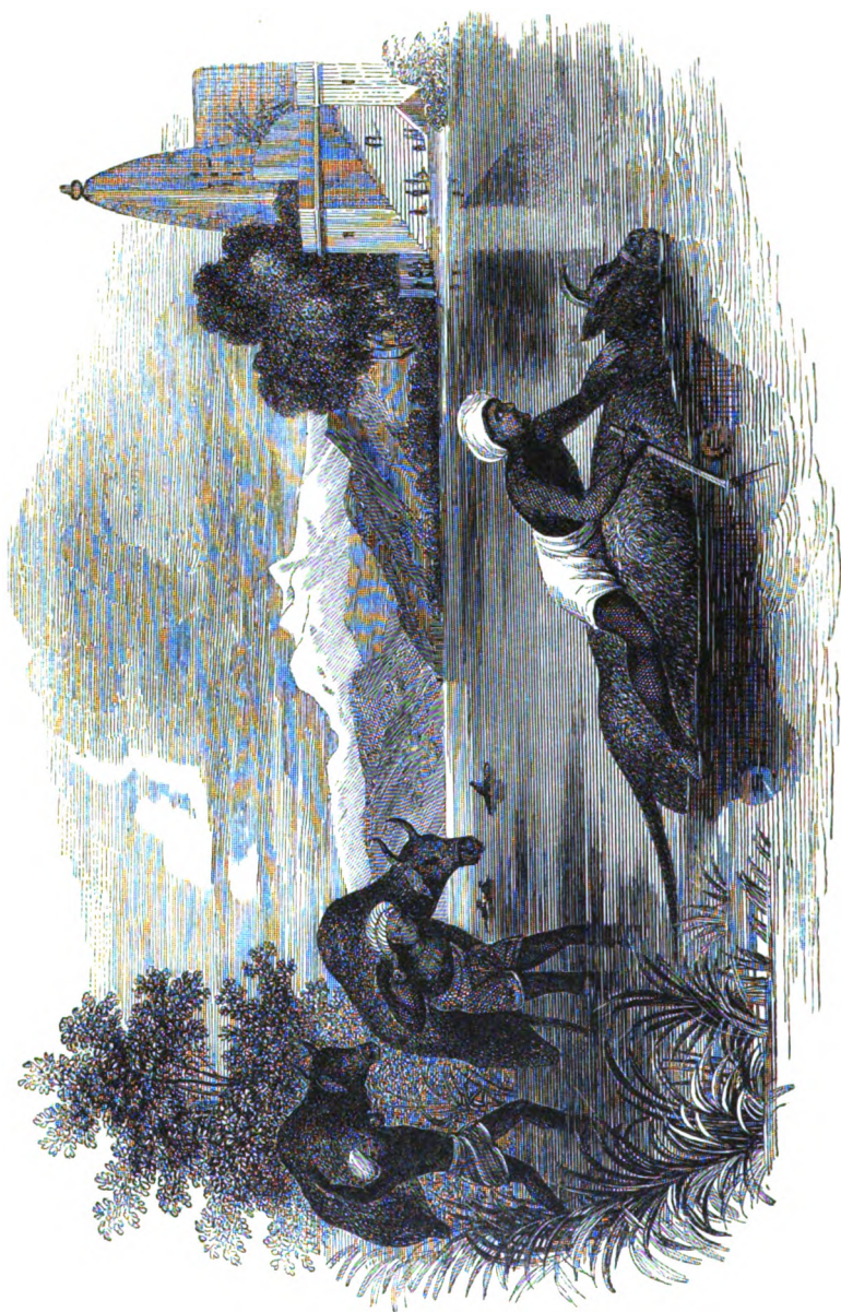
Method of crossing Rivers in the Panjab on inflated Skins.