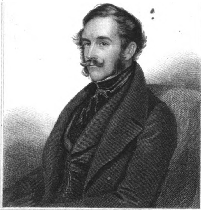
Portrait by [unclear]