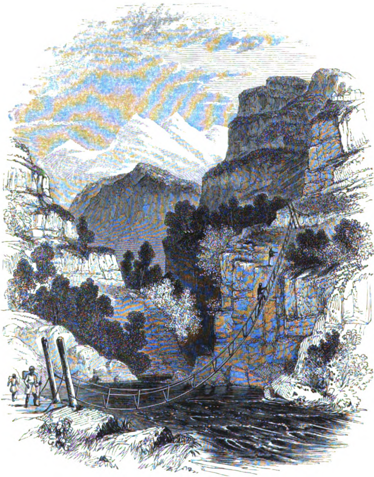
Remarkable Suspension Bridge at Uri.