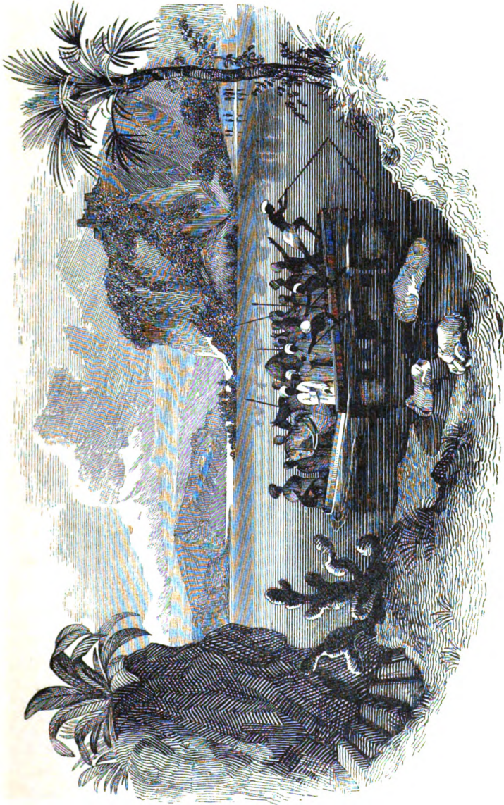
Frontier Ferry Boat on the Setlej, at Bilaspoor.